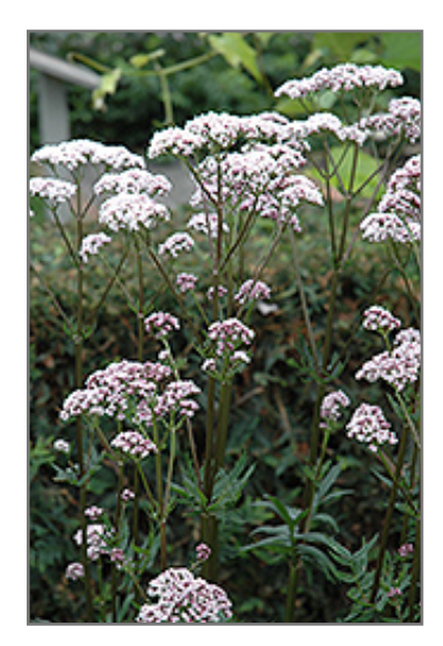
Common Valerian flowers