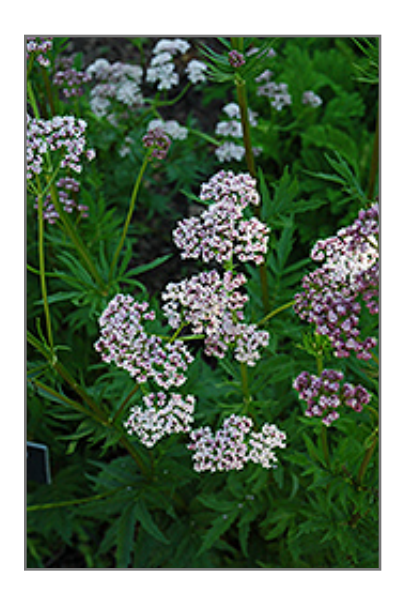
Common Valerian flowers