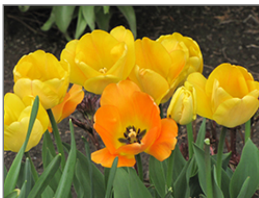
Daydream Tulip in bloom