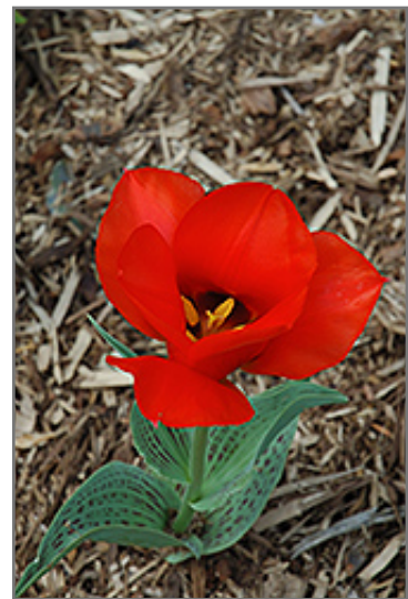
Casa Grande Tulip flowers