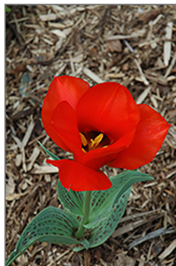
Casa Grande Tulip flowers