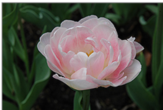
Angelique Tulip flowers