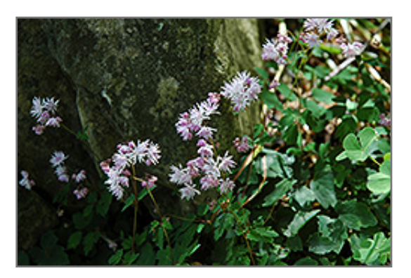
Dwarf Korean Meadow Rue flowers

Dwarf Korean Meadow Rue features airy panicles of lilac purple flowers with white overtones rising above the foliage from mid to late summer. Its lobed compound leaves remain forest green in colour throughout the season.