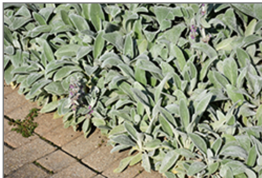
Lamb's Ears

Lamb's Ears is a fine choice for the garden, but it is also a good selection for planting in outdoor pots and containers. It can be used either as 'filler' or as a 'thriller' in the 'spiller-thriller-filler' container combination, depending on the height and form of the other plants used in the container planting. Note that when growing plants in outdoor containers and baskets, they may require more frequent waterings than they would in the yard or garden.