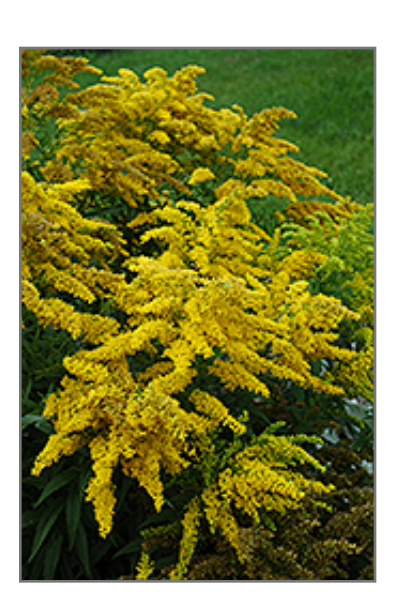
Crown Of Rays Goldenrod flowers