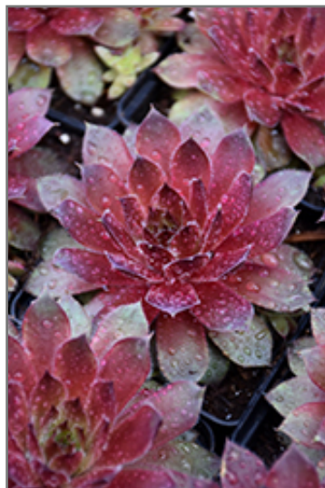
More Honey Hens And Chicks