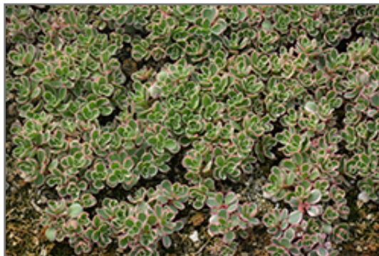
Tricolor Stonecrop flowers

Tricolor Stonecrop is a fine choice for the garden, but it is also a good selection for planting in outdoor pots and containers. Because of its spreading habit of growth, it is ideally suited for use as a 'spiller' in the 'spiller-thriller-filler' container combination; plant it near the edges where it can spill gracefully over the pot. Note that when growing plants in outdoor containers and baskets, they may require more frequent waterings than they would in the yard or garden.