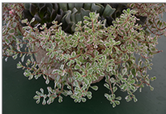
Tricolor Stonecrop