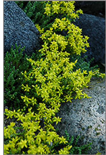
Six Row Stonecrop flowers