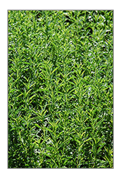
Winter Savory