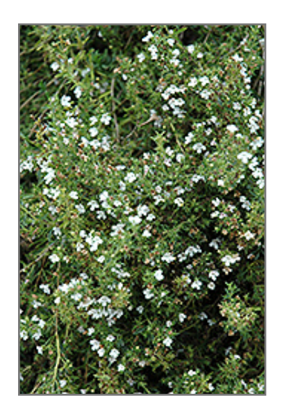
Winter Savory flowers