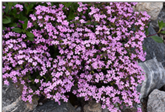
Rock Soapwort in bloom