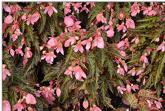
I'Conia Upright Salmon Begonia flowers