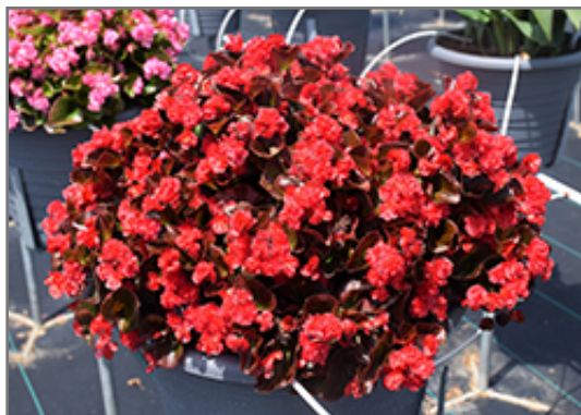
Double Up Red Begonia in bloom