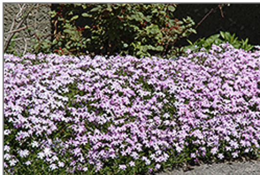
Emerald Blue Moss Phlox in bloom

Emerald Blue Moss Phlox will grow to be only 4 inches tall at maturity, with a spread of 18 inches. When grown in masses or used as a bedding plant, individual plants should be spaced approximately 15 inches apart. Its foliage tends to remain low and dense right to the ground. It grows at a medium rate, and under ideal conditions can be expected to live for approximately 10 years. As an evergreen perennial, this plant will typically keep its form and foliage year-round.