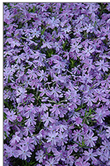
Emerald Blue Moss Phlox flowers

Emerald Blue Moss Phlox is recommended for the following landscape applications;