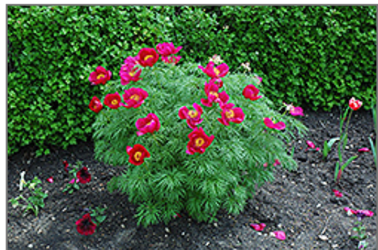
Fernleaf Peony in bloom