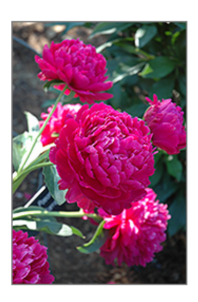
Paul Wild Peony flowers

Paul Wild Peony will grow to be about 30 inches tall at maturity, with a spread of 3 feet. When grown in masses or used as a bedding plant, individual plants should be spaced approximately 30 inches apart. The flower stalks can be weak and so it may require staking in exposed sites or excessively rich soils. It grows at a slow rate, and under ideal conditions can be expected to live for approximately 20 years. As an herbaceous perennial, this plant will usually die back to the crown each winter, and will regrow from the base each spring. Be careful not to disturb the crown in late winter when it may not be readily seen!