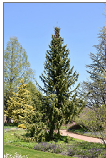
Serbian Spruce