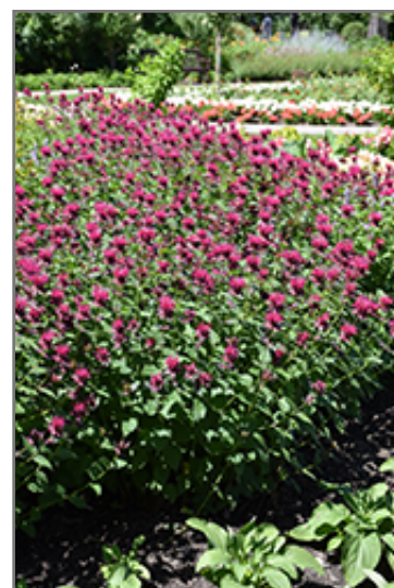
Raspberry Wine Beebalm in bloom