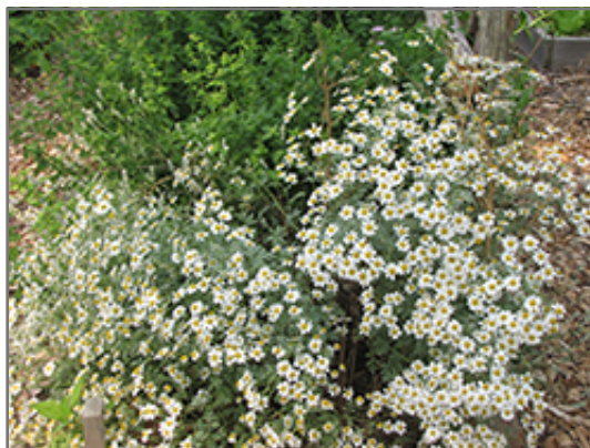
German Chamomile

German Chamomile will grow to be about 24 inches tall at maturity, with a spread of 18 inches. It grows at a fast rate, and under ideal conditions can be expected to live for approximately 5 years. As an herbaceous perennial, this plant will usually die back to the crown each winter, and will regrow from the base each spring. Be careful not to disturb the crown in late winter when it may not be readily seen!