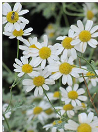
German Chamomile flowers