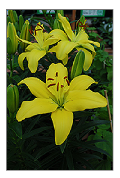
Yellow Pixie Lily flowers

Yellow Pixie Lily features bold yellow trumpet-shaped flowers with brown anthers at the ends of the stems in early summer. The flowers are excellent for cutting. Its narrow leaves remain green in colour throughout the season.