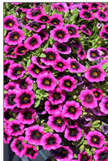
Superbells Blackcurrent Punch Calibrachoa flowers

This plant will require occasional maintenance and upkeep. Trim off the flower heads after they fade and die to encourage more blooms late into the season. It is a good choice for attracting bees and hummingbirds to your yard, but is not particularly attractive to deer who tend to leave it alone in favor of tastier treats. It has no significant negative characteristics.