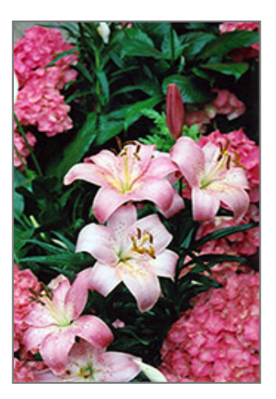
Magento Lily flowers

Magento Lily features bold shell pink trumpet-shaped flowers with fuchsia tips at the ends of the stems in early summer. The flowers are excellent for cutting. Its narrow leaves remain green in colour throughout the season.