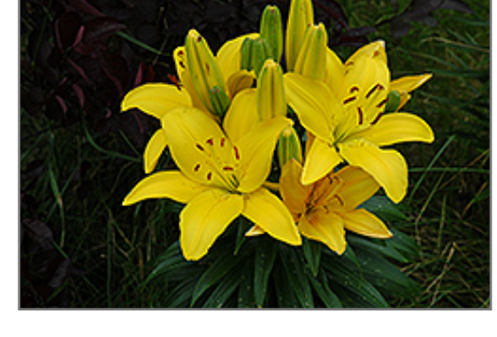
Butter Pixie Lily flowers