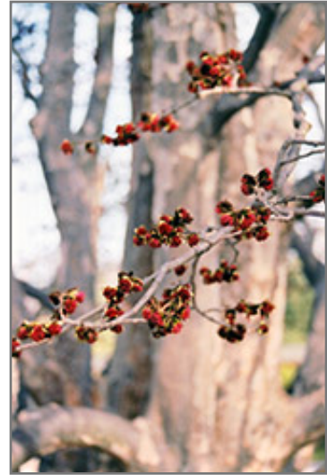
Persian Parrotia flowers

This tree should only be grown in full sunlight. It is very adaptable to both dry and moist locations, and should do just fine under average home landscape conditions. It is not particular as to soil type or pH. It is highly tolerant of urban pollution and will even thrive in inner city environments. This species is not originally from North America.