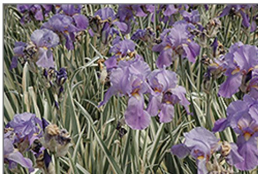
Variegated Sweet Iris flowers