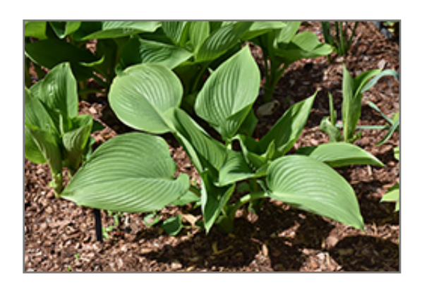
Elatior Hosta