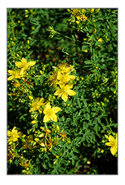
St. John's Wort flowers

St. John's Wort has masses of beautiful gold star-shaped flowers at the ends of the stems from early to mid summer, which are most effective when planted in groupings. Its narrow leaves remain green in colour throughout the season.