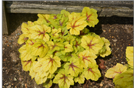
Catching Fire Foamy Bells

Catching Fire Foamy Bells is a dense herbaceous evergreen perennial with tall flower stalks held atop a low mound of foliage. Its medium texture blends into the garden, but can always be balanced by a couple of finer or coarser plants for an effective composition.