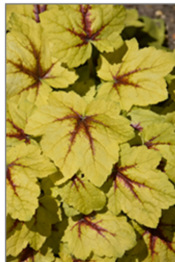
Catching Fire Foamy Bells foliage