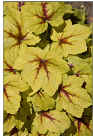
Catching Fire Foamy Bells foliage