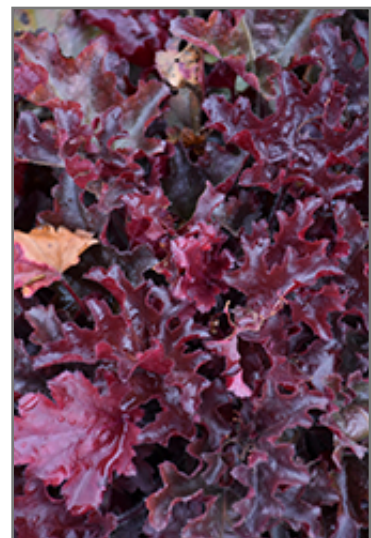
Dolce Cherry Truffles Coral Bells foliage