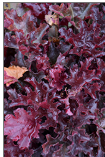
Dolce Cherry Truffles Coral Bells foliage