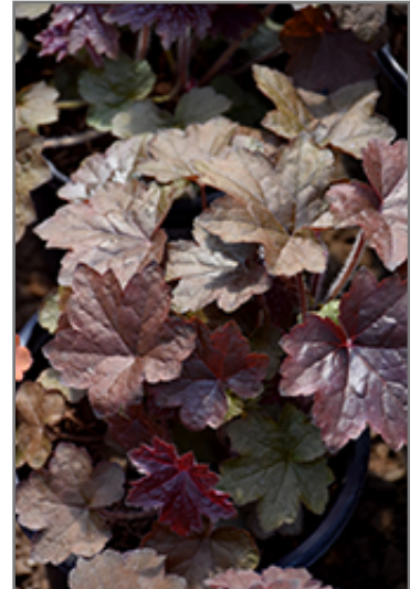
Palace Purple Coral Bells foliage

Palace Purple Coral Bells is recommended for the following landscape applications;