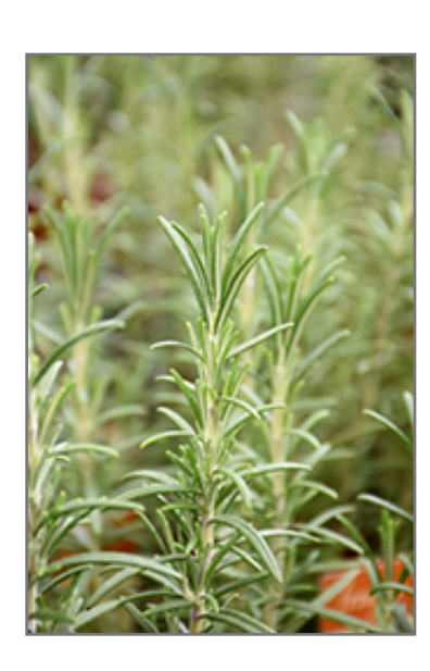
Ingauno Rosemary foliage

Aside from its primary use as an edible, Ingauno Rosemary is sutiable for the following landscape applications;