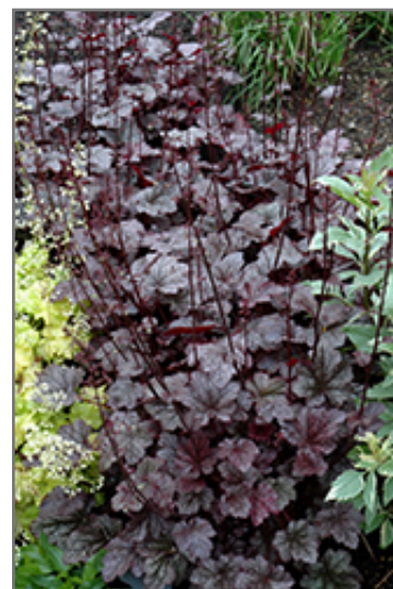
Plum Pudding Coral Bells in bloom