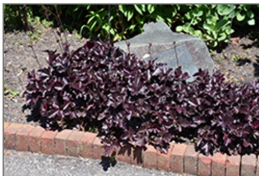
Obsidian Coral Bells