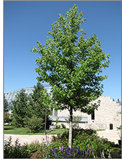
Sweet Gum

This tree should only be grown in full sunlight. It prefers to grow in average to moist conditions, and shouldn't be allowed to dry out. It is very fussy about its soil conditions and must have rich, acidic soils to ensure success, and is subject to chlorosis (yellowing) of the foliage in alkaline soils. It is somewhat tolerant of urban pollution. This species is native to parts of North America.