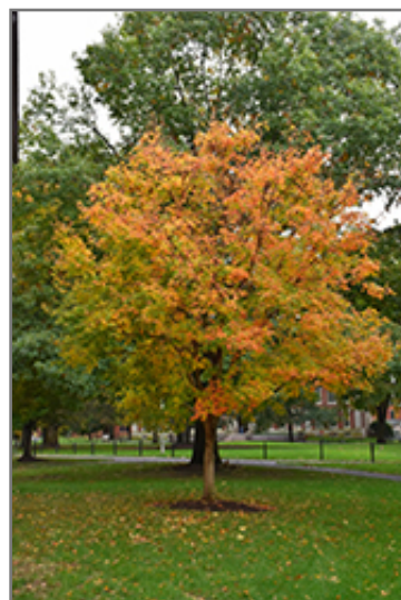
Three Flowered Maple in fall