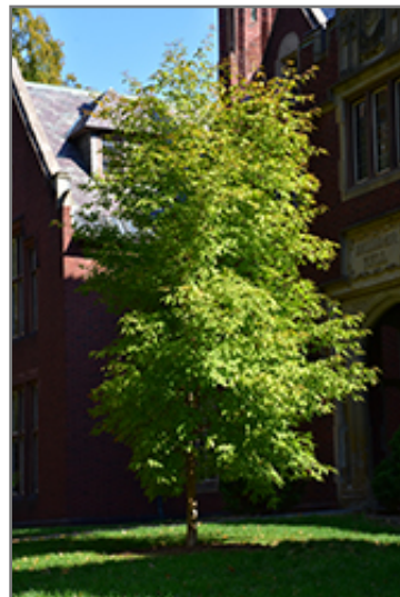
Three Flowered Maple