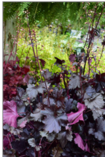
Black Pearl Coral Bells in bloom

This is a relatively low maintenance plant, and should be cut back in late fall in preparation for winter. It is a good choice for attracting hummingbirds to your yard. It has no significant negative characteristics.