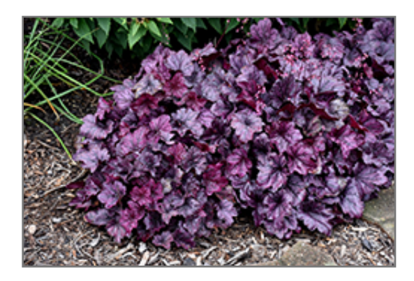
Wild Rose Coral Bells

Wild Rose Coral Bells is a dense herbaceous evergreen perennial with tall flower stalks held atop a low mound of foliage. Its relatively coarse texture can be used to stand it apart from other garden plants with finer foliage.