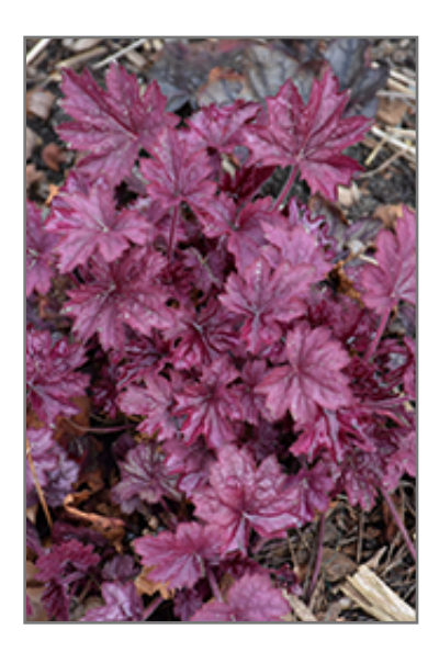
Wild Rose Coral Bells foliage