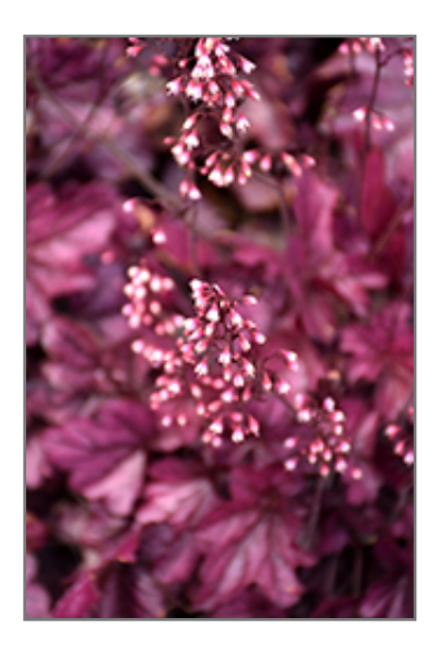
Wild Rose Coral Bells flowers

Wild Rose Coral Bells is a fine choice for the garden, but it is also a good selection for planting in outdoor pots and containers. With its upright habit of growth, it is best suited for use as a 'thriller' in the 'spiller-thriller-filler' container combination; plant it near the center of the pot, surrounded by smaller plants and those that spill over the edges. Note that when growing plants in outdoor containers and baskets, they may require more frequent waterings than they would in the yard or garden.