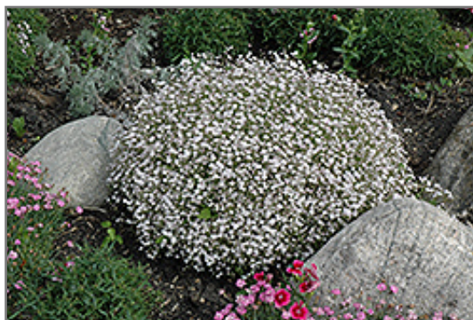
Creeping Baby's Breath in bloom

Creeping Baby's Breath is recommended for the following landscape applications;