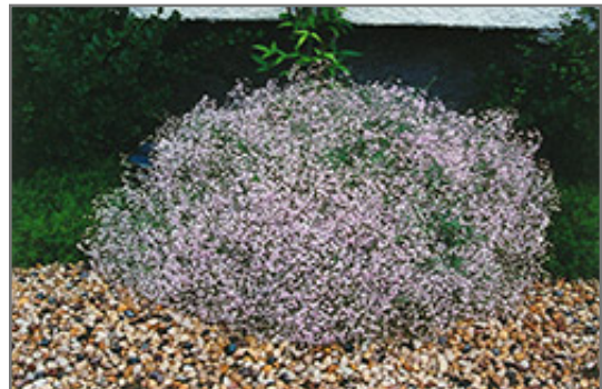
Pink Fairy Baby's Breath in bloom