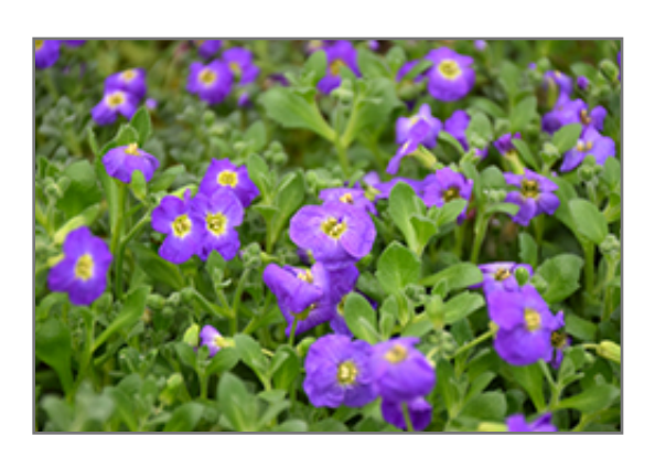
Audrey Deep Blue Shades Rock Cress flowers