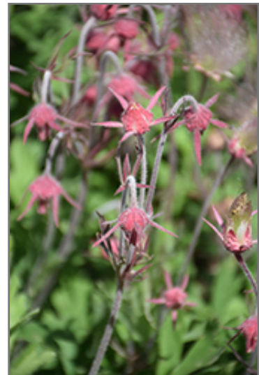
Prairie Smoke flower buds