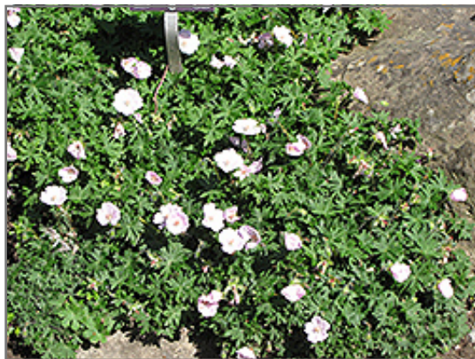
Striated Cranesbill in bloom