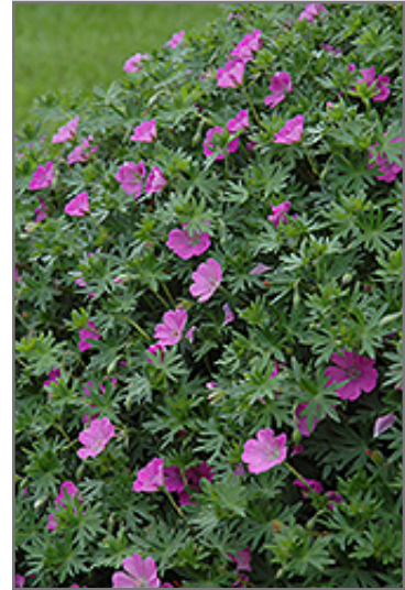
Bloody Cranesbill flowers

This is a relatively low maintenance plant, and should only be pruned after flowering to avoid removing any of the current season's flowers. It is a good choice for attracting butterflies to your yard, but is not particularly attractive to deer who tend to leave it alone in favor of tastier treats. Gardeners should be aware of the following characteristic(s) that may warrant special consideration;