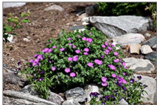
Bloody Cranesbill in bloom