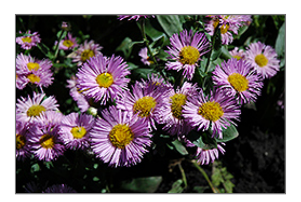
Pink Jewel Fleabane flowers