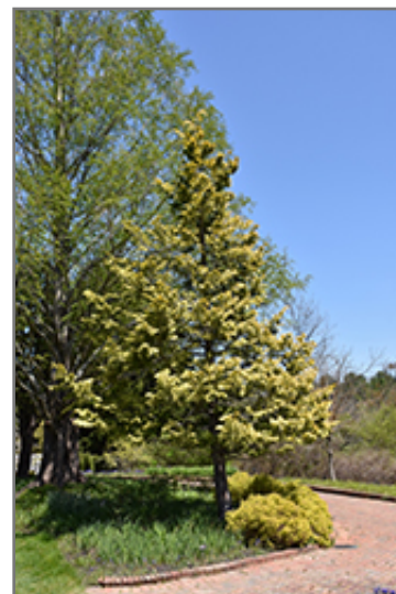
Cripps Gold Falsecypress

This tree does best in full sun to partial shade. It prefers to grow in average to moist conditions, and shouldn't be allowed to dry out. It is not particular as to soil type or pH. It is highly tolerant of urban pollution and will even thrive in inner city environments, and will benefit from being planted in a relatively sheltered location. Consider applying a thick mulch around the root zone in winter to protect it in exposed locations or colder microclimates. This is a selected variety of a species not originally from North America.