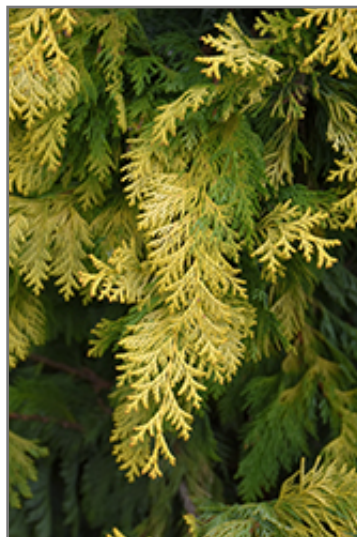
Cripps Gold Falsecypress foliage