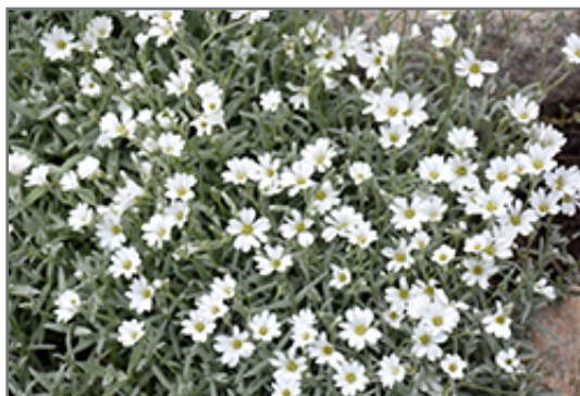
Snow-In-Summer flowers