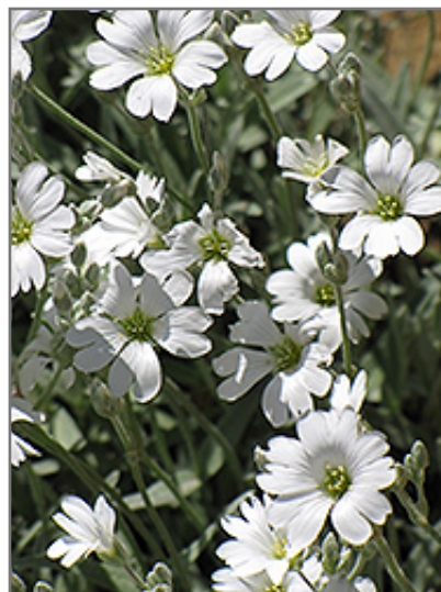
Snow-In-Summer flowers