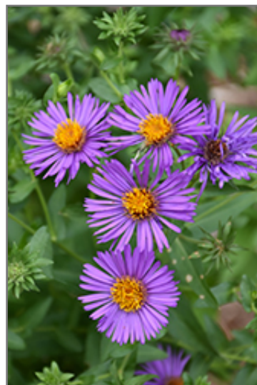
Purple Beauty Aster flowers

Purple Beauty Aster is recommended for the following landscape applications;