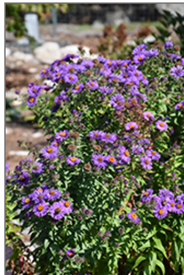
Purple Beauty Aster flowers

This plant does best in full sun to partial shade. It prefers to grow in average to moist conditions, and shouldn't be allowed to dry out. It is not particular as to soil type or pH. It is somewhat tolerant of urban pollution. This is a selection of a native North American species. It can be propagated by division; however, as a cultivated variety, be aware that it may be subject to certain restrictions or prohibitions on propagation.