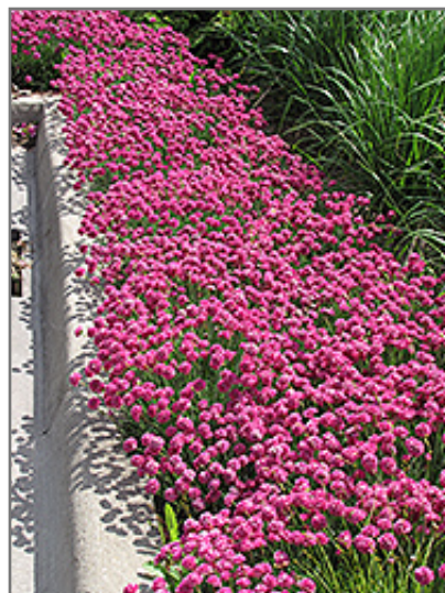
Dusseldorf Pride Sea Thrift in bloom

Dusseldorf Pride Sea Thrift is recommended for the following landscape applications;