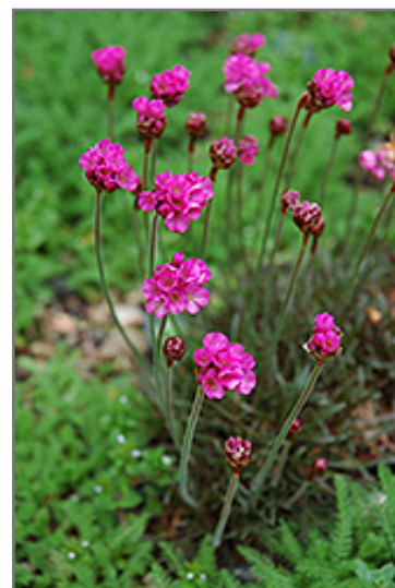
Dusseldorf Pride Sea Thrift flowers