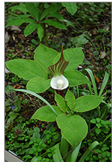
Japanese Jack-In-The-Pulpit in bloom